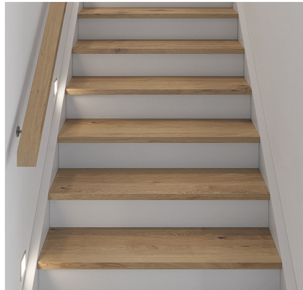
Victorian Ash with painted risers