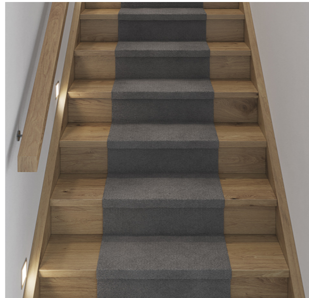
Victorian Ash with carpet runners