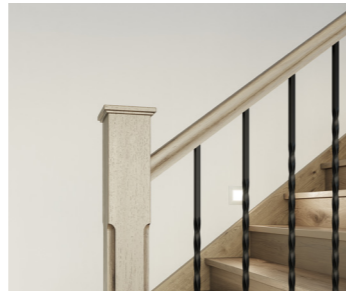
Provence Page 12