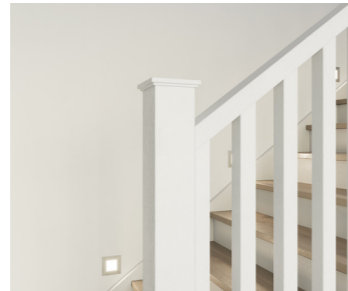
Long Island Page 11