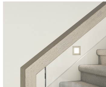
Byron Page 13