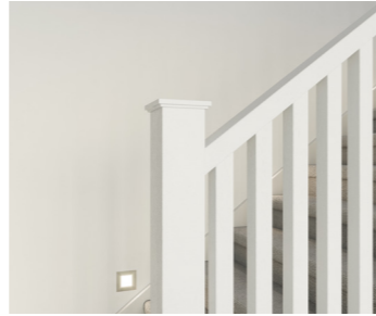
Hampton Page 9