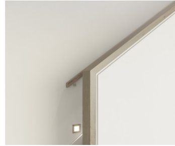
Oslo Page 8