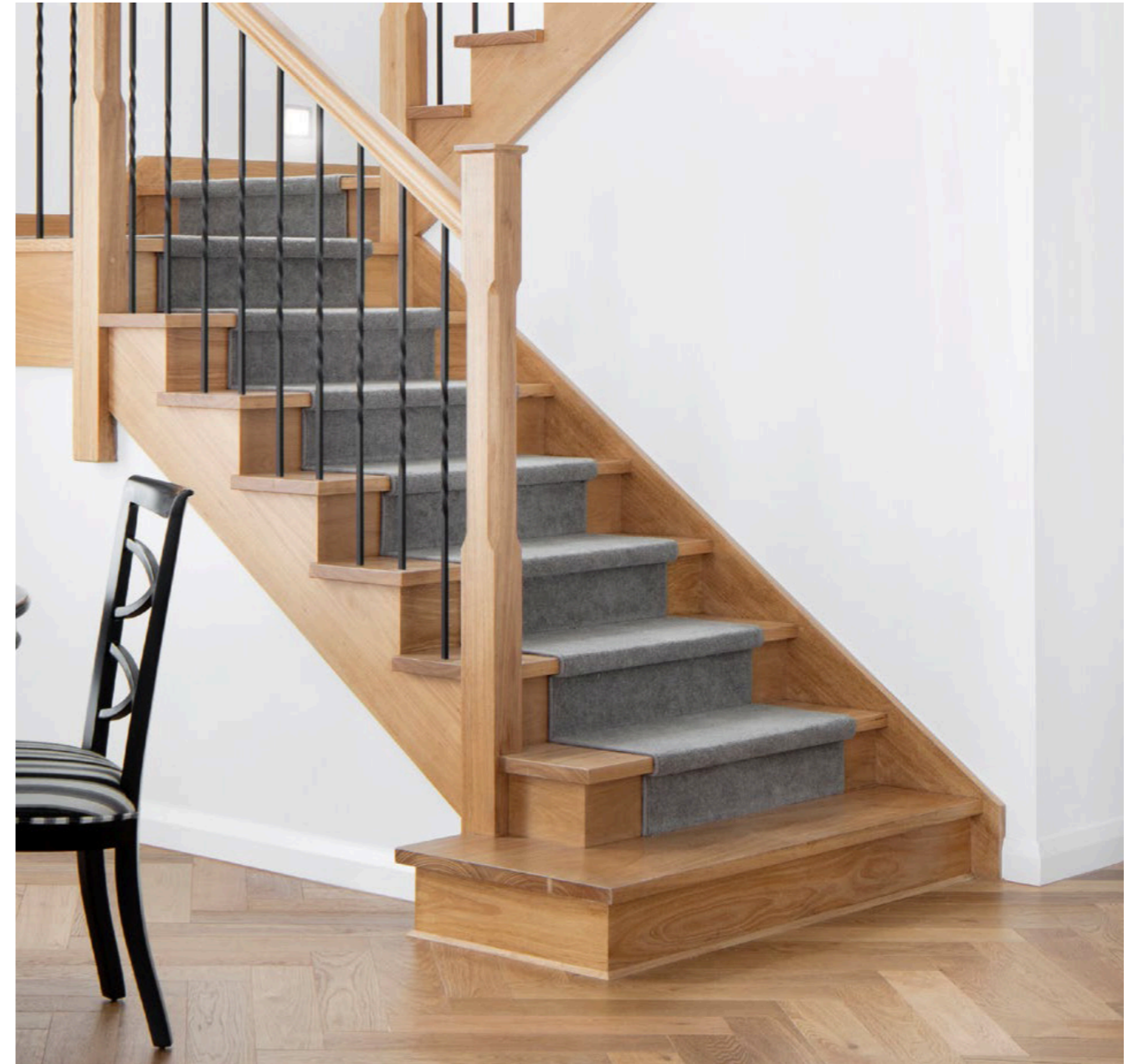
Add square bullnose feature bottom tread

Bottom tread only applicable with the following balustrade designs: Santiago, Hampton, Miami, Dubai, Provence, Long Island and Berlin.