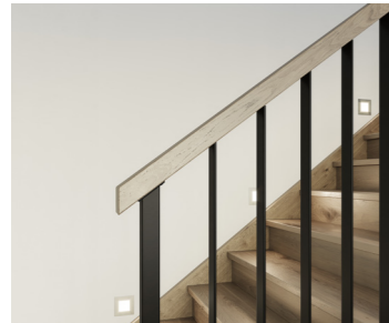
Berlin Page 10