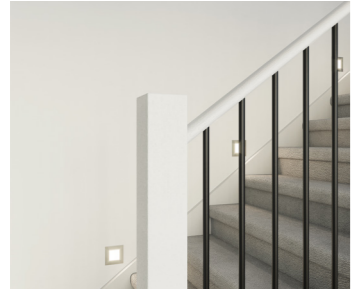
Santiago Page 7