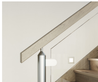
Dubai Page 15