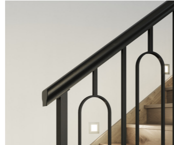
Miami Page 14