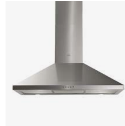
ILVE 900mm Canopy Rangehood IVG901X