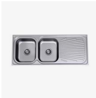
Double Bowl Inset Sink (Design Specific)