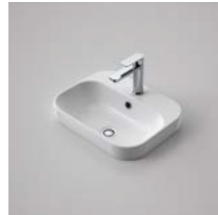
Luna Inset Basin (Design Specific)