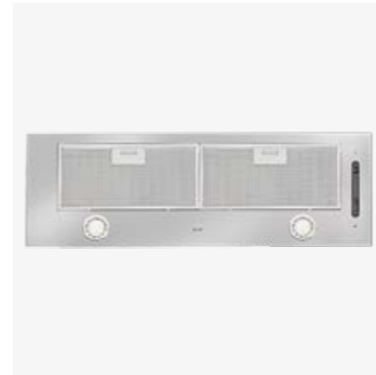
ILVE Concealed Rangehood 900mm CU89/90