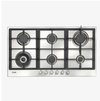
ILVE Gas Cooktop 900mm ILGP96X