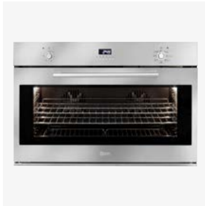
ILVE Electric Built-In Oven 900mm ILO994X