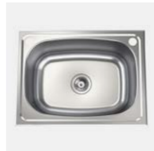
Clark Single 45L Flushline Tub (Design Specific)

Please note colours are to be used as a guide only and may appear different in person. All imagery is illustrative only and features upgrade items including flooring, appliances, cabinetry, fixtures and fittings. Facade images are to be used as a guide only and may show decorative items not included in the base price including fencing, landscaping, windows and furnishings. Please note CGIs depict a 2550mm ceiling height. Contact your New Homes Consultant for house specific drawings to assist you in making your choice. Colour selections are subject to change without notice. Boutique Homes reserves the right to swap colours for a similar item if the item is discontinued by the supplier.