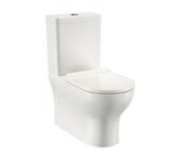
Clark Round Back To Wall Toilet Suite