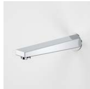
Vivas Wall Bath Spout (Design Specific)