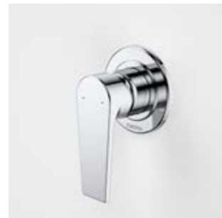
Vivas Wall Mixer