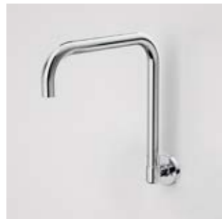
Metro Wall Sink Outlet