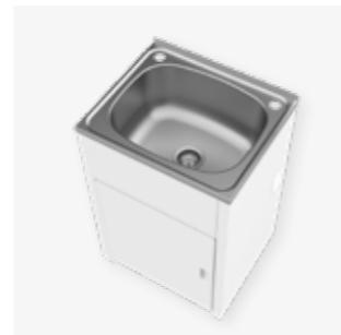
42L Utility Standard Tub & Cabinet (Design Specific)