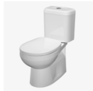
Stylus Prima II Toilet Suite