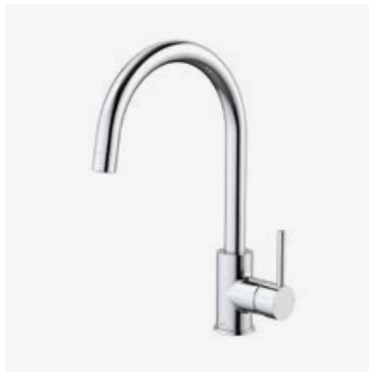
Poseidon Sink Mixer