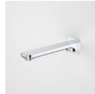
Luna Basin / Bath Spout 226mm