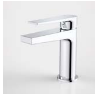
Vivas Basin Mixer