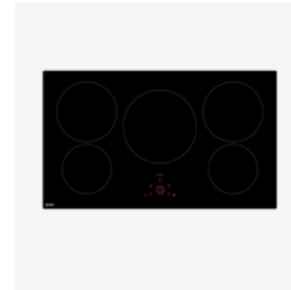
ILVE 900mm Induction Cooktop ILD88B

Please note colours are to be used as a guide only and may appear different in person. All imagery is illustrative only and features upgrade items including flooring, appliances, cabinetry, fixtures and fittings. Facade images are to be used as a guide only and may show decorative items not included in the base price including fencing, landscaping, windows and furnishings. Please note CGIs depict a 2550mm ceiling height. Contact your New Homes Consultant for house specific drawings to assist you in making your choice. Colour selections are subject to change without notice. Boutique Homes reserves the right to swap colours for a similar item if the item is discontinued by the supplier.