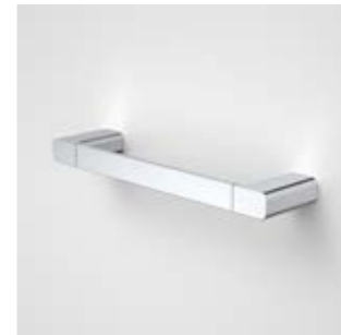
Luna Contemporary Hand Towel Rail 265mm