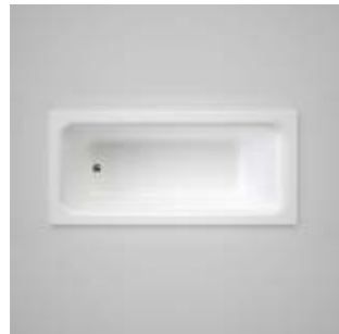
Vivas 1675 Bath to main bathroom (Design Specific)