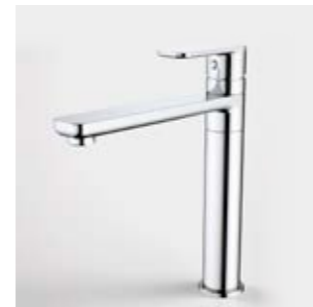
Luna Kitchen Mixer