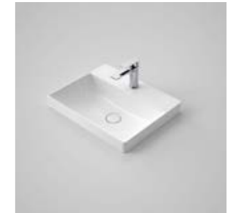
Caroma Urbane II Inset Basin