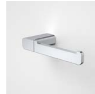
Luna Contemporary Toilet Roll Holder