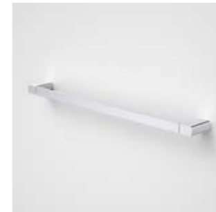
Luna Contemporary Single Towel Rail 600mm