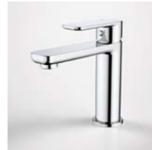
Luna Basin Mixer