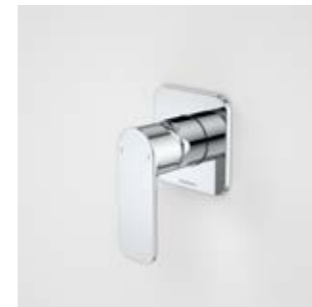
Luna Wall Mixer